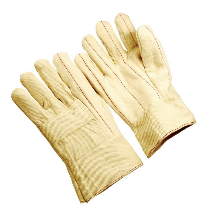
*Hotmill gloves can withstand up to 400 degrees. However the duration in which you are holding an object determines how long you can withstand heat.