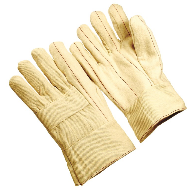
*Hotmill gloves can withstand up to 500 degrees. However, the duration in which you can hold an object determines how long you can withstand heat.